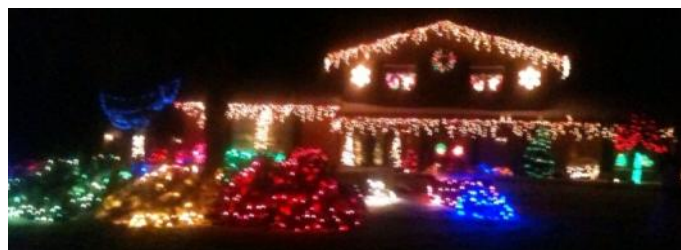
Skittles...not just a candy anymore! Now a holiday light set!