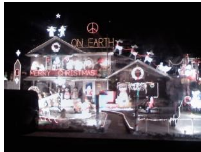
This is what happens when you don't have an Association! Chaos!!

Here are a few of the worst houses I could find and fortunately none were in our communities!