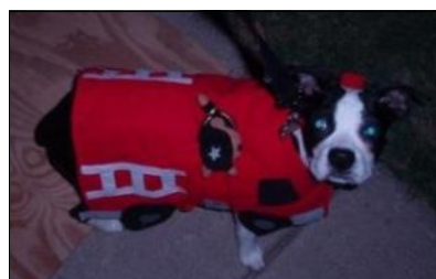
My dog Beckham dressed as a fire truck!