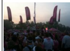
Circle of Survivors